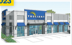
Greer 901 W Wade Hampton Blvd Greer, SC 29650