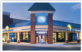
Pelham Road 3621 Pelham Rd Greenville, SC 29615