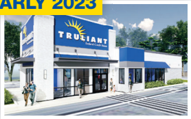
Easley 5660 Calhoun Memorial Pkwy Easley, SC 29640