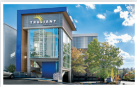
Upstate Regional Office 110 W North St Greenville, SC 29601