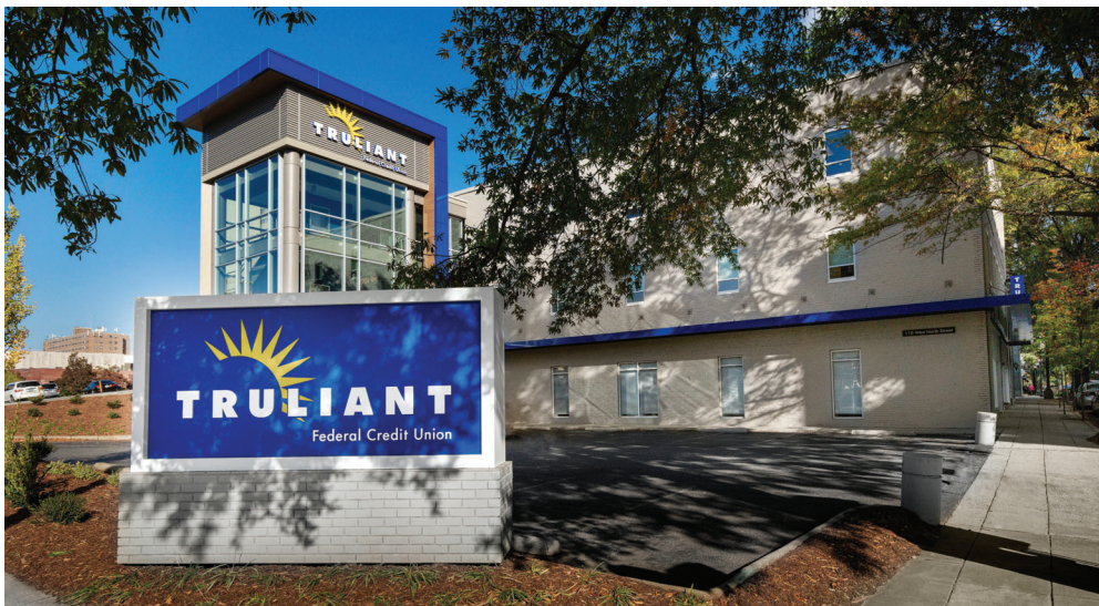
Upstate Regional Office