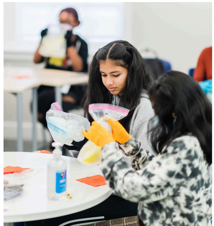
LEAD Girls of NC develops teen girls in Forsyth County into confident, active community leaders.

“This year we saw a 30% increase in girls feeling they can give an honest ‘no’ to things they don’t want to